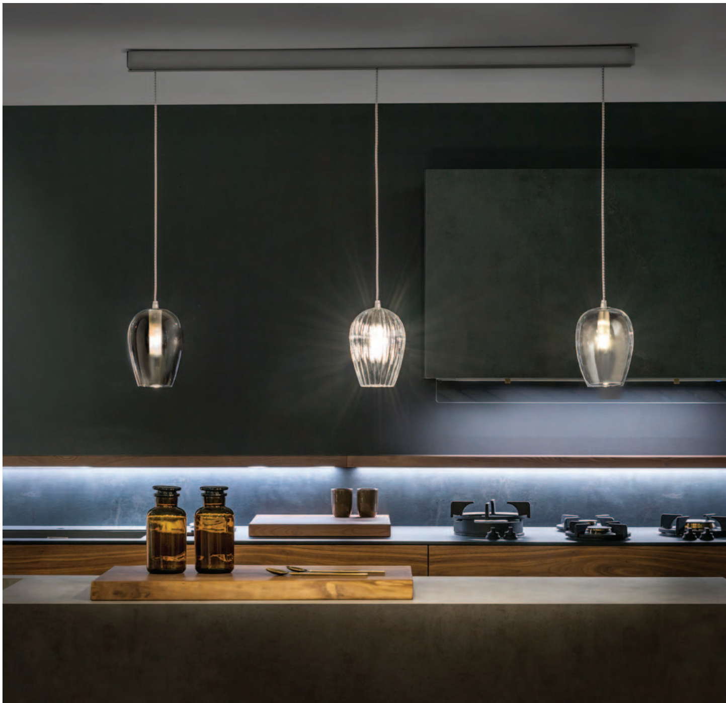
Barra XL + Pendolino XXL